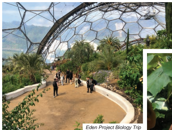
Eden Project Biology Trip