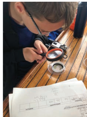
STEAM Aquarium Trip