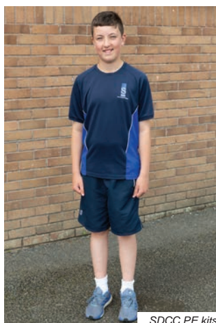
SDCC PE kits