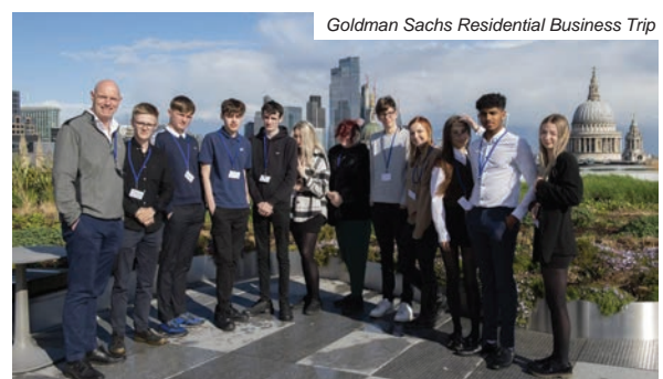
Goldman Sachs Residential Business Trip