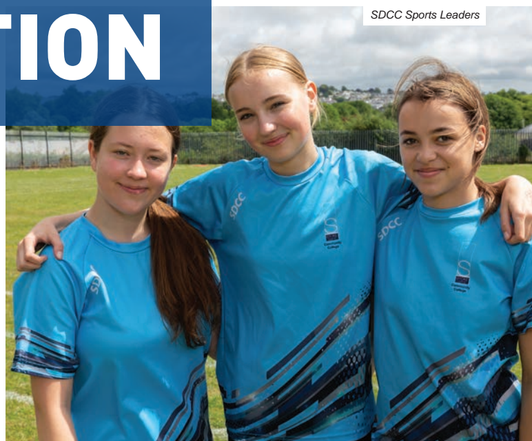
SDCC Sports Leaders