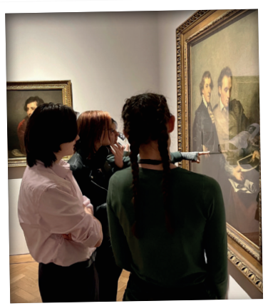
The Box Trip