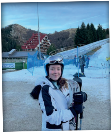
Campus Ski Trip, Italy