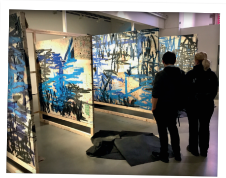
Art Trip to the British Art Show