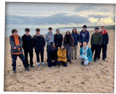
Geography Trip to Slapton