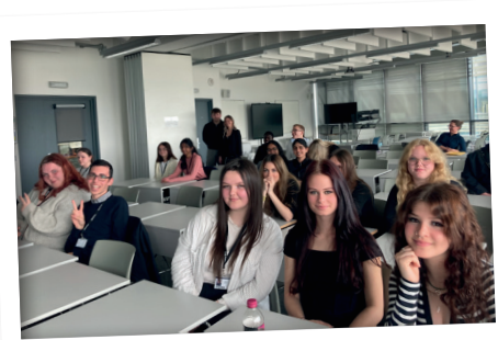
Medical law convention, Plymouth University