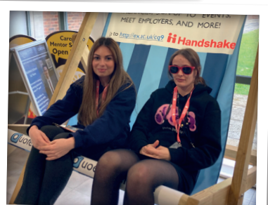
Exeter University Campus Trip