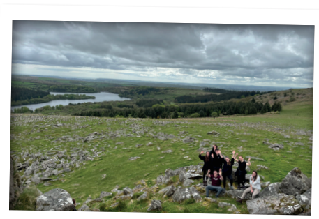
Gold Duke of Edinburgh