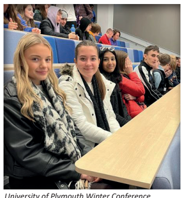
University of Plymouth Winter Conference