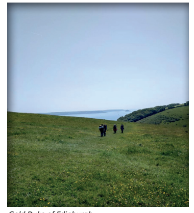
Gold Duke of Edinburgh