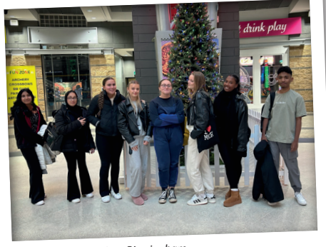
Exam booster session, Birmingham