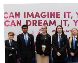
Smeaton House Captains