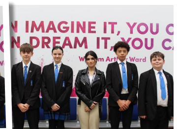
Sutton House Captains