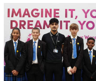
Mayflower House Captains

Each house selected a cause they feel passionate about, and we look forward to seeing the community come together to raise funds and make a real difference for these charities.