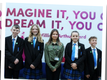
Saltram House Captains